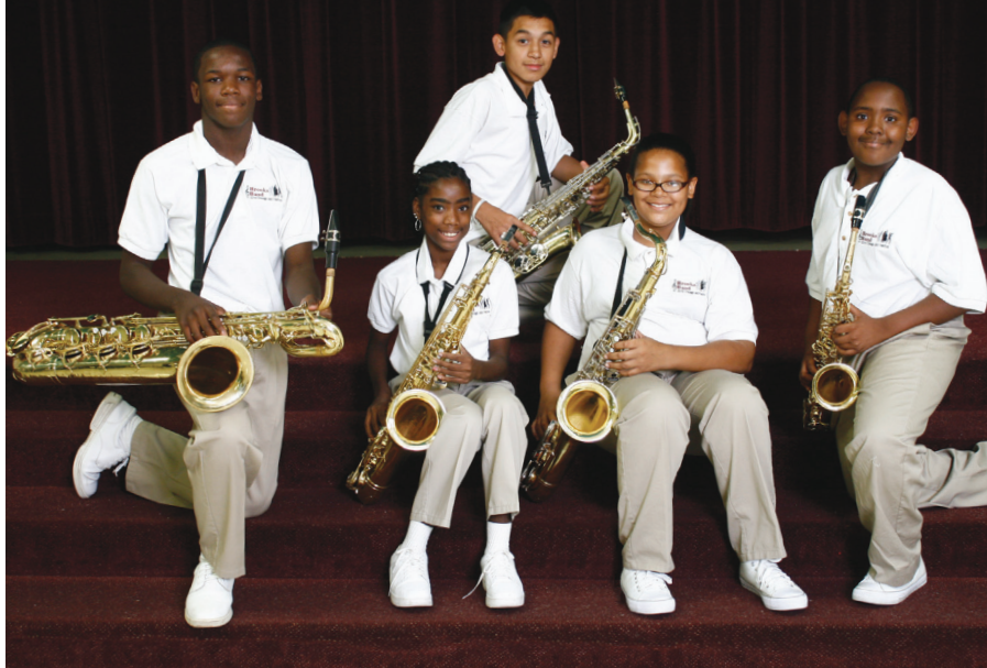
The Gwendolyn Brooks Middle School Jazz Ensemble

Call us at: 1-800-4-SAMASH or Shop On-Line: www.samash.com 1 (800) 472-6274